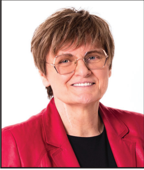
Katalin Karikó, Ph.D.

Katalin Karikó is a professor at University of Szeged and adjunct professor at the University of Pennsylvania. From 2013 to 2022 she was a senior vice president at BioNTech. Prior to BioNTech, she worked for 24 years at the University of Pennsylvania. For decades, her research has been focusing on RNA-mediated mechanisms with the goal of developing in vitro-transcribed mRNA for therapy. She co-founded and served as CEO of RNARx. Her patents co-invented with Drew Weissman on nucleoside-modified uridines in mRNA were used to create the FDA-approved COVID-19 mRNA vaccines by BioNTech/Pfizer and Moderna. For her achievement, Karikó received many prestigious awards, including the 2023 Nobel Prize in Physiology or Medicine.